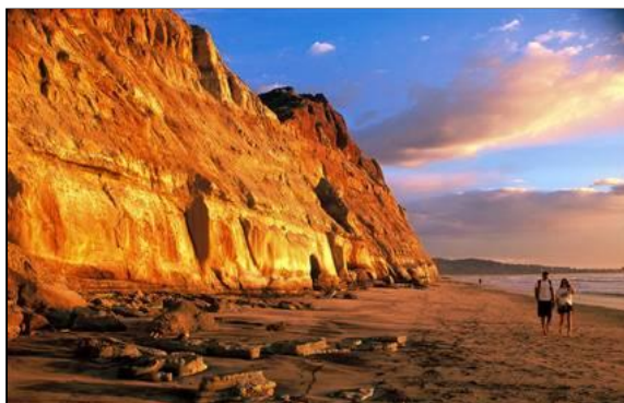
San Diego Convention & Visitors Bureau

Take advantage of the extra cash and spend it on a summer getaway